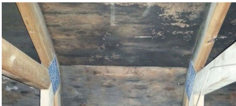
Mould growth in an attic

Yes, it is common, but should it be ignored? Opinions differ as to whether or not the mold spores in an attic spread into your home through vapour pressure. In other words, when you open and close doors, does the vapour pressure move the spores out of your attic and into your living area? Are you breathing them in? I guess the question is, would you be comfortable living in a home with mold in the attic?